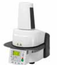
Programat EP 3000/G2