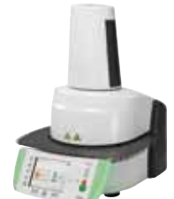
Programat EP 5000/G2